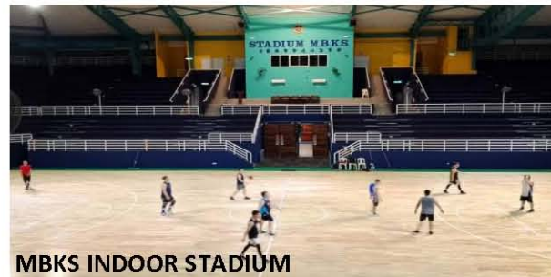
MBKS INDOOR STADIUM

Located at Pending Recreation Park at Jalan Utama, Pending. The Indoor Stadium has 3,000 seating capacity and substantial parking lots, venue for Basketball purposes only.