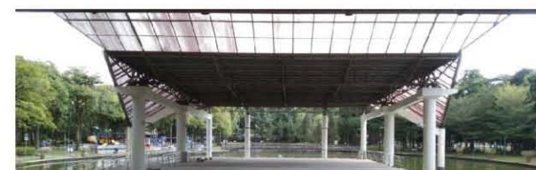
MBKS THEATRE (PANGGUNG MBKS) @ KUCANG PARK LAKE

Situated at Kuching Park Lake, ideal place to organise outdoor event party such wedding dinner, concert and other function.