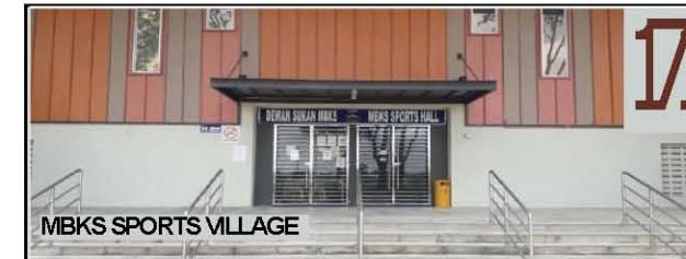
MBKS SPORTS VILLAGE

NOTE: (i) Charges for charitable bodies: Half of the above rental. Deposit: RM500.00 per usage (ii) Deposit for wedding/dinner function: RM1,000.00