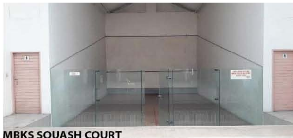
MBKS SQUASH COURT

Two standard size Squash Court located at the Pending Recreation Park at Jalan Utama, Pending. Suitable for daily practice or competition with affordable charges. Ample parking bays for users. A great place for squash activities.